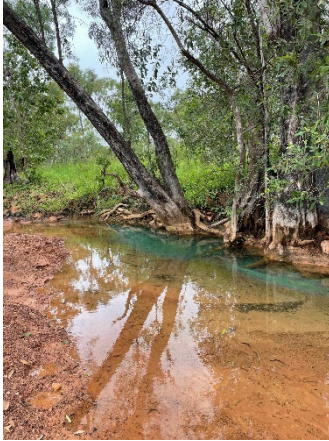
Hanrahan's Creek, downstream from Sandy Flat

A breakdown of expenditure and remediation activity at Sandy Flat during 2022-23: