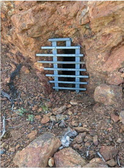
Burnt Shirt Adit Grate - Tennant Creek Region

A breakdown of expenditure and remediation activity under the Small Mines Safety Program during 2022-23: