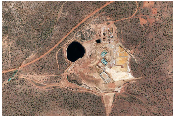
Aerial view - Sandy Flat

Sandy Flat is located in the Gulf region of the Northern Territory (NT) approximately 30 km west of the Queensland / NT border and 70 km inland from the Gulf of Carpentaria. Mining activities at the site have led to environmental impacts primarily caused by acid and metalliferous drainage (AMD), resulting in pollution of Hanrahan's Creek.