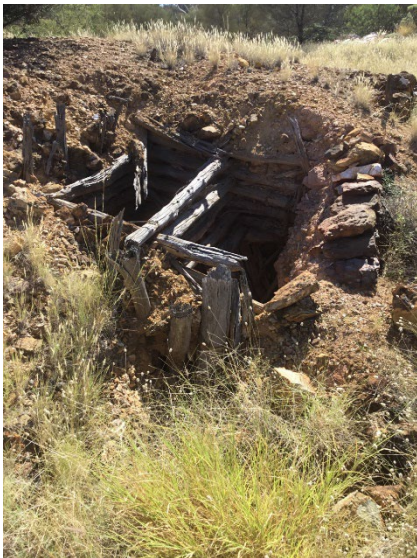
Junction Claim – Central Australia

Historic mining activities have left legacy mines across the Territory that present a potential risk to the environment, including public safety. The Small Mines Safety Program aims to address risks to public safety from historical mining activities such as open shafts or adits.